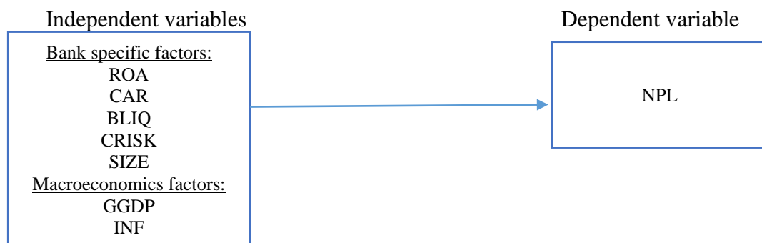
Figure 1: The Relationship among the Variables of the Study

The study is a descriptive and an analytical one; it is based on the secondary data collected from various resources such as the commercial banks' financial statements, reports and previous empirical studies. The sample of the study included all banks operating in the kingdom of Saudi Arabia. The scope of the study purposively covered the period from 2009 to 2018 post to the global financial crises that took place in the year 2008 to test the effect of non-performing loans on selected banks specific factors i.e. (Liquidity, Return on Assets, and Capital Adequacy Ratio) during that period. The investigation is done by adopting a causality research design and deductive research strategy. The research uses Descriptive Statistics, Correlation, Regression and tools to test the relationship, OLS and Granger casualty tests.